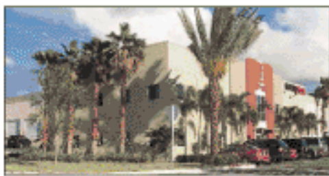
OUR CURRENT HEADQUARTERS

Established and headquartered in Miami, Florida since 1995, Blackstone® is privately owned, and managed by a team of executives experienced in payments processing, networking, information services, oil & gas and prepaid telecommunications. Under their direction, Blackstone® has established ongoing distribution relationships with internationally recognized companies such as Qwest, Americatel, AT&T, Cingular, AT&T Wireless and VoiceStream.