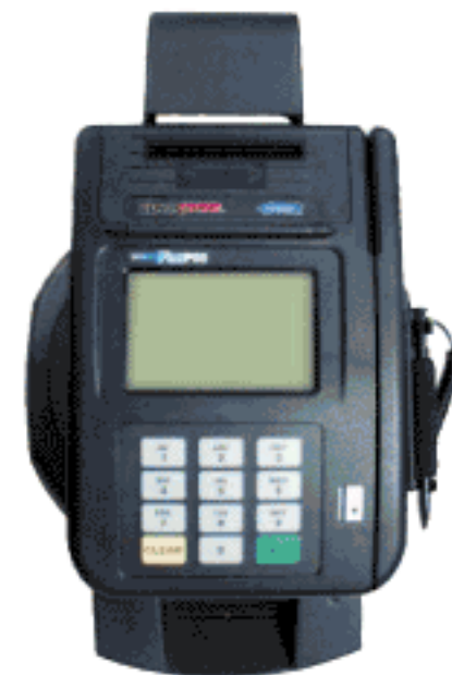
The patented Blackstone POS® system

Established and headquartered in Miami, Florida since 1995, Blackstone is privately owned, and operated by a team of leaders from various industries including banking, IT, sales & marketing, operations and telecommunications. Under their direction, Blackstone is evolving into an international solutions provider with a global network of alliances and resources.