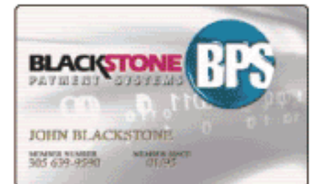
Blackstone Payment Systems® program card

to focus on their core business. Already, Blackstone has successfully completed projects for a variety of industries, such as an enhanced billing system, Blackstone Payments Systems; computer telephony integration (CTI) for multi-national call centers; plus, projects focusing on electronic delivery using our versatile POST appliances, networking and e-business strategies.