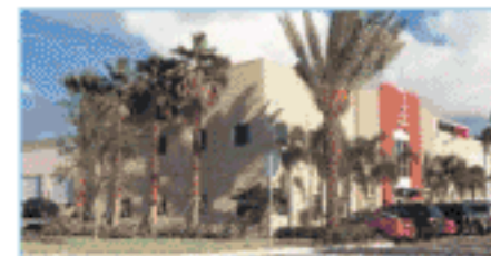
Our current headquarters

As the prepaid telecommunications industry exploded in the United States in the early 90's, Blackstone became a leading distributor of prepaid products servicing over 300,000 retail accounts. This success led to the development of a truly innovative point-of-sale system, the patented Blackstone POS, which successfully integrates the processing of all major credit cards and ATM/debit/EBT cards with the sale of prepaid products into one, easy-to-use POS terminal.